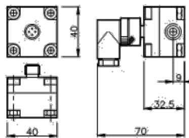
316 St St body ¼" thread