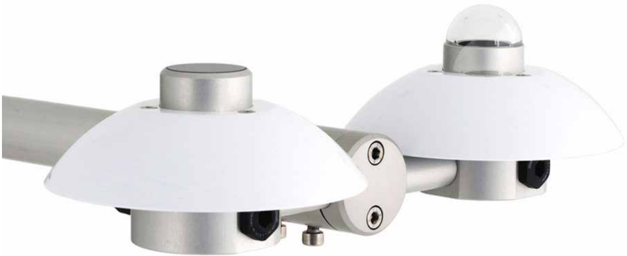
Figure 1 RA01 2-component radiometer

RA01 is a 2-component radiation sensor that is used for scientific-grade energy balance and surface flux studies. It offers separate measurements of solar and longwave radiation. When combined with estimates of solar albedo and of local surface temperature, this instrument can also be used for estimation of net radiation. The advantages of this approach are cost reduction and independence from local surface properties.