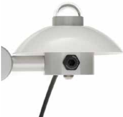
Figure 4 RA01 2-component radiometer in detail

Applicable instrument-classification standards are ISO 9060 and WMO-No.-8; Guide to Meteorological Instruments and Methods of Observation.